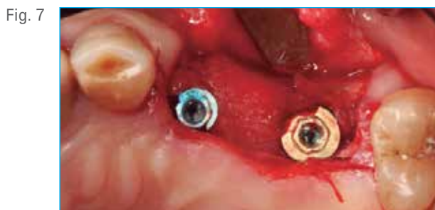
Fig. 7 Occlusal view of the two implants in place before healing abutment placement and proceeding to flap closure.