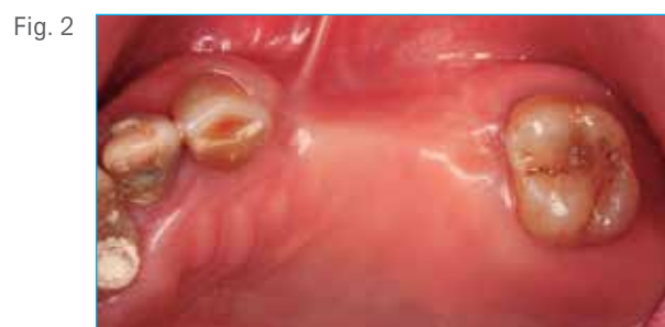
Fig. 2 Occlusal view, note the buccal concavity in the edentulous area.