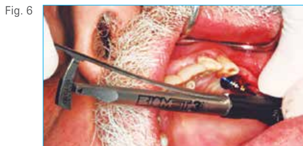
Fig. 6 Hand ratcheting the implant to its final position. Final seating torque reading: 70 Ncm.