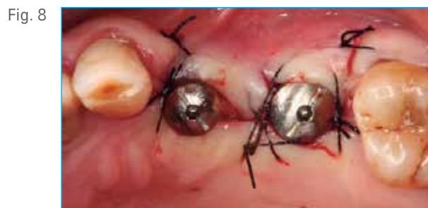
Fig. 8 Flap closure around the healing abutments following the Palacci technique to increase the thickness of the buccal gingiva.