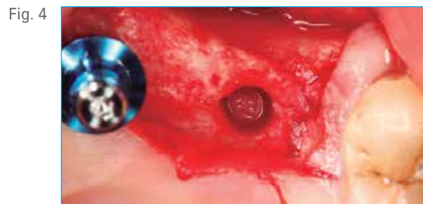
Fig. 4 Insertion of a T3® Tapered Implant 4 mm D x 11.5 mm L in the first premolar region. Osteotomy preparation was performed with a small drill and a convex osteotome to push the cortical bone into the sinus cavity.