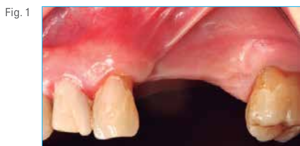
Fig. 1 Preoperative clinical photograph showing the missing premolars and first molar.

The 62-year-old male patient presented with missing teeth in the left posterior maxilla. Clinical and radiographic examination revealed the presence of sufficient vertical and horizontal bone height to enable placement of a long implant in the first premolar region and adequate width, but insufficient height, in the first molar region. A treatment plan was developed that called for a standard length implant in the premolar region and a short implant in the molar site. The implants were submerged for 6 months of healing. A definitive three-unit bridge was then delivered.