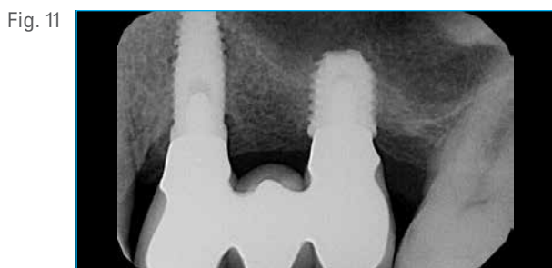
Fig. 11 Control radiograph 6 months post-op. Note the consolidation of the bone around the apex of the T3 Short Implant.