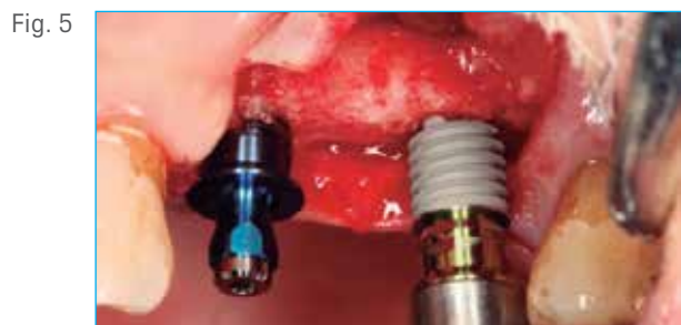
Fig. 5 Insertion of a T3 Short Implant 5 mm D x 6 mm L in the molar region.