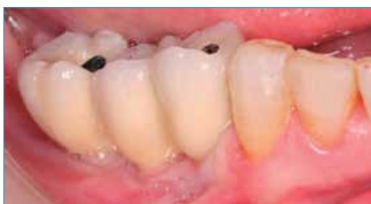
Delivery of the final screw-retained bridge 6 months after implant placement.