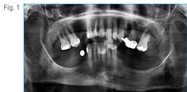
Fig. 1 Preoperative radiograph: Observe the very little bone height above the mental nerve in the mandibular right posterior quadrant.

The 70-year-old female was missing the mandibular posterior teeth in both quadrants. The clinical and radiographic studies revealed very little bone height, only 6 mm in the molar region of the mandibular right posterior quadrant with sufficient ridge width for a short, wide implant. The bone appeared dense and the gingiva thin and non-keratinized, in some areas as thin as 1 mm. The mandibular left quadrant had sufficient bone height for standard length implants. The treatment for the mandibular right quadrant consisted of placement of two short implants in tooth positions 29 and 30 [45 and 46] and a longer implant in tooth position 28 [44] using a conservative two-stage approach. Due to the advanced age and medical conditions of the patient it was decided to not do a connective tissue graft.