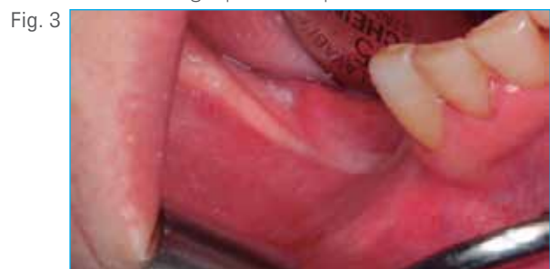
Fig. 3 Preoperative view.