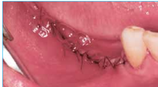
Sutures for submerged healing.