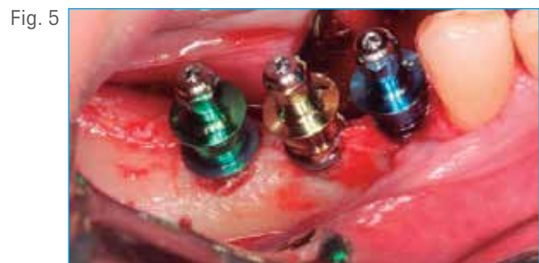
Fig. 5 Implant placement in position 28 [44] a T3® Tapered 4 mm D x 13 mm L, in position 29 [45] a T3 Short Implant 5 mm D x 5 mm L, in position 30 [46] a T3 Short implant 6 mm D x 5 mm L. After using the dense bone tap, 50 Ncm of insertion torque was registered.