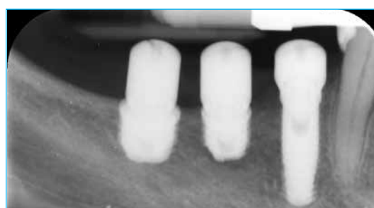
Radiographic control at 3 months.