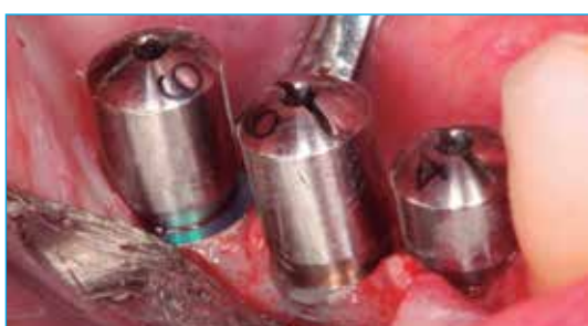
Second stage surgery after 3 months of healing. Connection of the healing abutments, with platform switching of the 5 and 6 mm diameter implants to aid in crestal bone preservation.