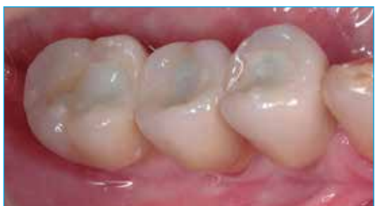
Occlusal view of the final metal-ceramic screw-retained three-unit bridge after sealing the screw-access holes 6 months post-surgery.