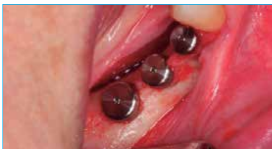
All three implants covered with their corresponding cover screws.