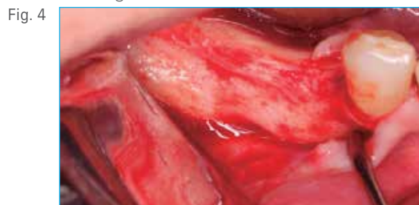
Fig. 4 Sufficient bone width for 5 and 6 mm diameter implants in the second premolar and first molar regions.