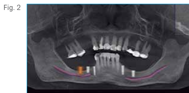
Fig. 2 Case planification with the Cone Bean CT scan. Only 6 mm bone height in the second premolar and first molar regions above the mental nerve.