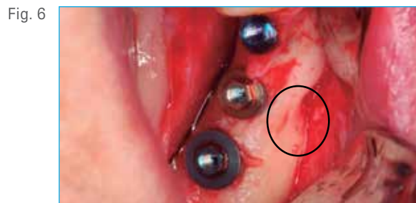
Fig. 6 Occlusal view of the implants, observe the vicinity of where the mental nerve exits.