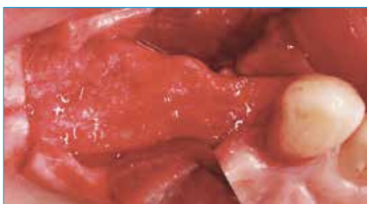
Fig. 3 Clinical view after flap elevation revealing a wide ridge, especially in the posterior area.