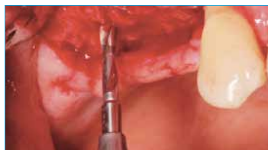
Fig. 4 Initial preparation osteotomy with the 2 mm diameter Twist Drill.