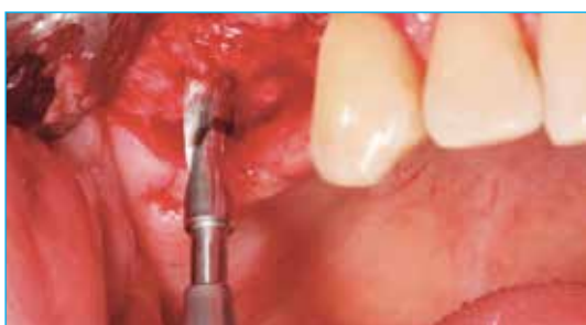
Fig. 5 Widening the osteotomy with the next drill in the recommended protocol (3.25 mm diameter Twist Drill).