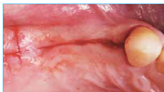
Fig. 2 Incision and flap design included a small t-shaped incision for better access without releasing into the vestibule.