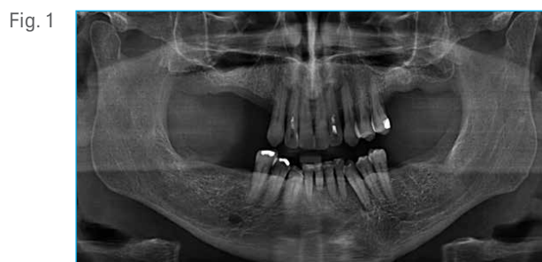
Fig. 1 Preoperative radiograph, showing limited bone height in the maxillary posterior quadrants.

The 50-year-old male presented with moderate to severe periodontitis and multiple missing posterior teeth. The radiographic examination revealed reduced vertical bone height in the right maxilla but sufficient bone width. The treatment plan developed included periodontal treatment with some extractions, implant placement in all four quadrants, and supportive periodontal therapy. The right quadrant included placement of a short implant in the first molar region and a longer implant in the first premolar region.