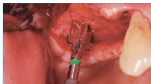
Fig. 6 Finishing the site preparation with the final Flat Bottom Shaping Drill for a 6 mm D x 6 mm L implant.