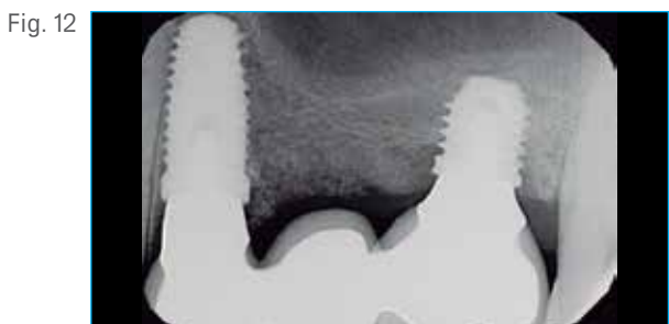
Fig. 12 Final radiograph 6 months post-op. Note the bone growth inside the sinus around the apex of the T3 Short Implant.