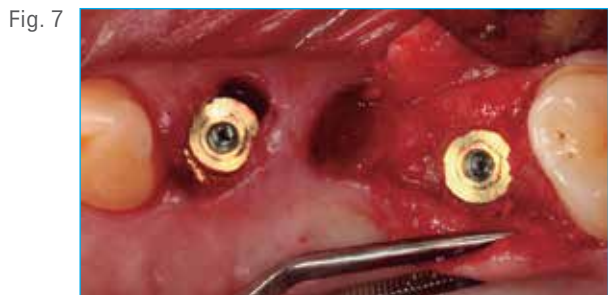
Fig. 7 Occlusal view of the two 5 mm diameter implants.