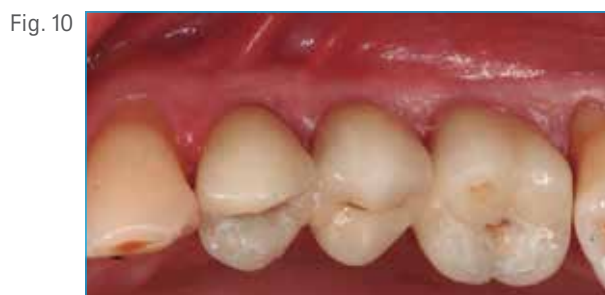
Fig. 10 Occlusal view of the definitive three-unit bridge 6 months post-op.