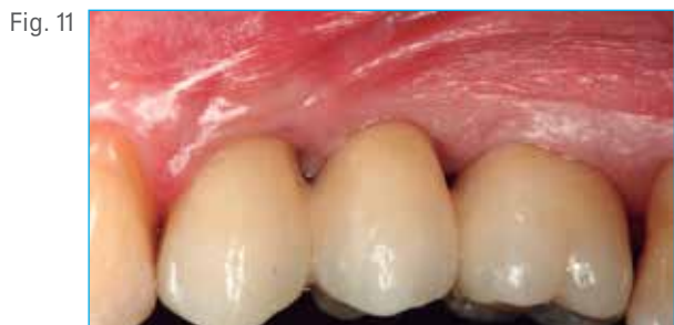
Fig. 11 Buccal view of the definitive prosthesis 6 months post-op.