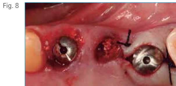
Fig. 8 Healing abutments in place for unsubmerged healing. The extraction sites are filled with Endobon® Xenograft Granules.