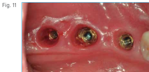
Fig. 11 4 months after placement the implants are osseointegrated and ready for the prosthetic phase.