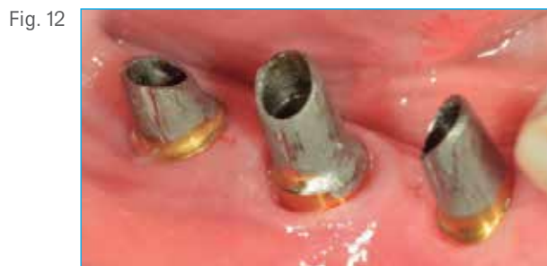
Fig. 12 Three Gingil-Hue® Abutments adjusted by the laboratory technician are placed and screwed into the implants with Gold-Tite® Screws torqued at 35 Ncm.