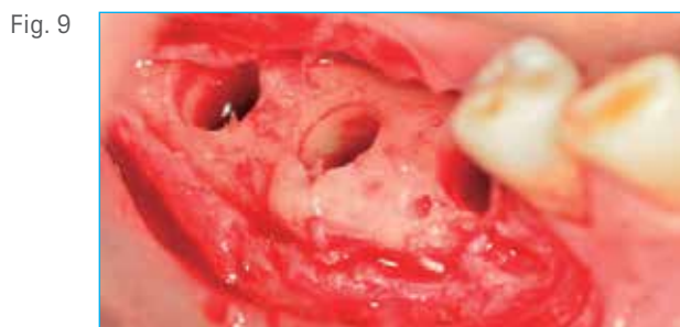
Fig. 9 Osteotomies in the regenerated sites following the drilling protocol of the T3® Short Implant system.