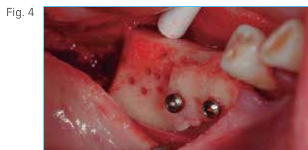
Fig. 4 Autogenous bone block harvested from the retro-molar area and fixed with two mini-screws in tooth positions 29 and 30 [45 and 46].