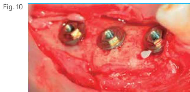
Fig. 10 Three T3 Short Implants of 5 mm diameter x 5 mm length were placed.