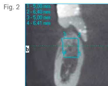
Fig. 2 Cone Bean CT scan after the bone augmentation. The implant site width now allows for the placement of a 5 mm diameter implant.