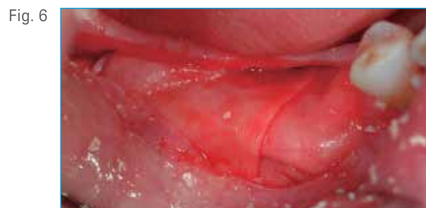
Fig. 6 The bone grafts are covered by two resorbable collagen membranes.