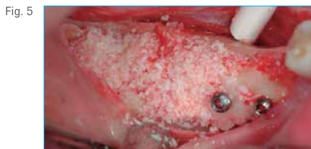
Fig. 5 The bone block and the distal zones are covered with particulated xenograft.