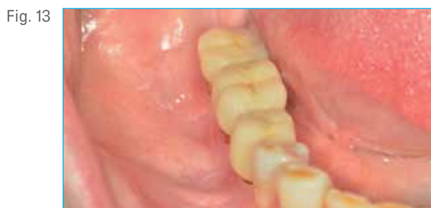
Fig. 13 Final cement-retained bridge in place 9 months after the augmentation surgery and 5 months after implant placement.