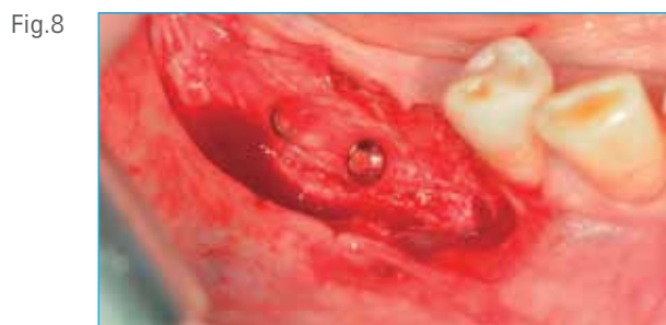
Fig. 8 Reopening of the grafted sites after 4 months of healing. The bone block has been biologically incorporated. Optimal ridge thickness has been achieved for placement of 5 mm diameter implants.