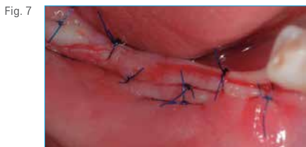
Fig. 7 Suturing after horizontal augmentation procedure. Note the primary closure achieved.