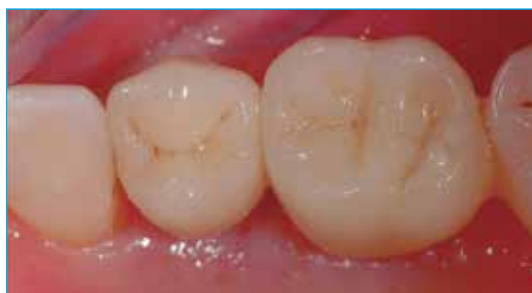
Occlusal view of the definitive crowns.