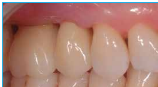
Final cemented single-unit premolar and molar crowns.