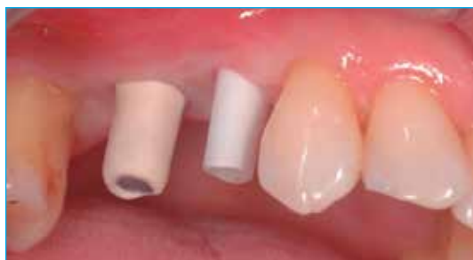
Two definitive abutments in place 4.5 months after implant placement.