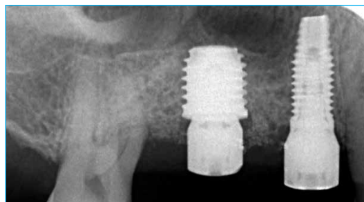
Radiograph at second-stage surgery 4 months post-op. Manual platform switching was done on the T3® Short Implant by placing a 5 mm diameter healing abutment on the 6 mm diameter implant.