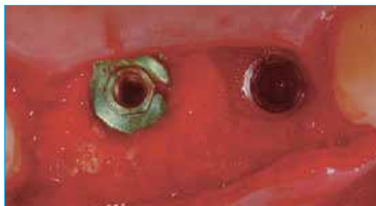
Re-opening 4 months after surgery.